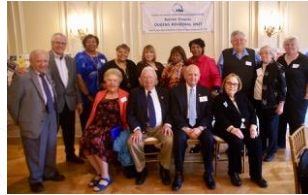
Queens Executive Board 2018

CSA Queens Retirees Website www.csaqueens.org